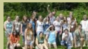
North Country Youth to Youth Participants

North Country Professional Development Day will be on Friday, October 9, 2009 at White Mountains Regional High School. The program booklet will be available for download from the NCES website on or around September 11 and the registration period will be from September 14-25.